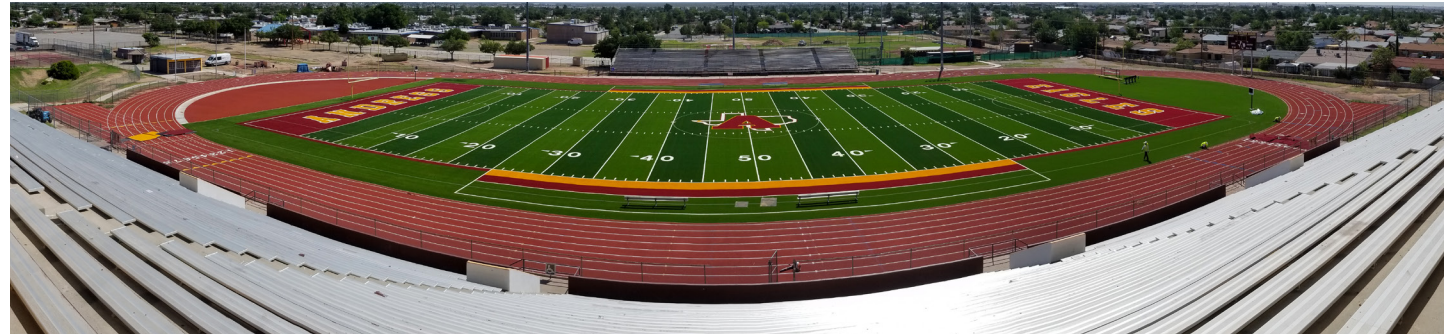
Andress High School