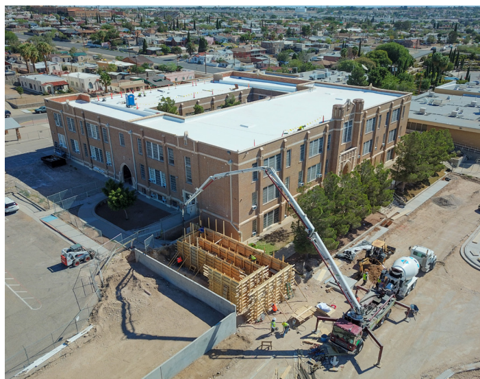
Photos: Header- Crockett Elementary under construction Center- Crockett Students celebrating at the project groundbreaking Bottom- Drone photo of Crockett under construction