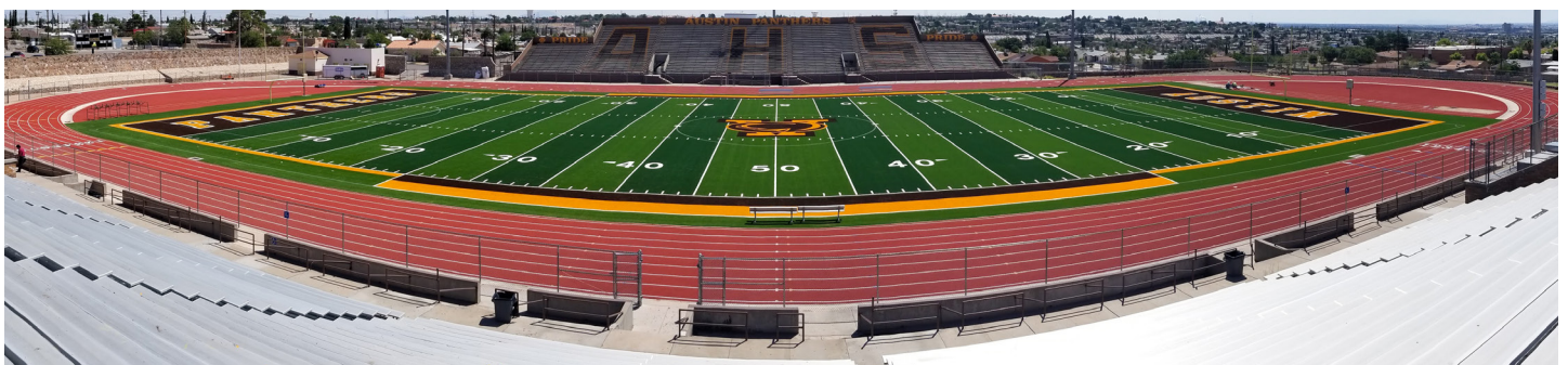
Austin High School