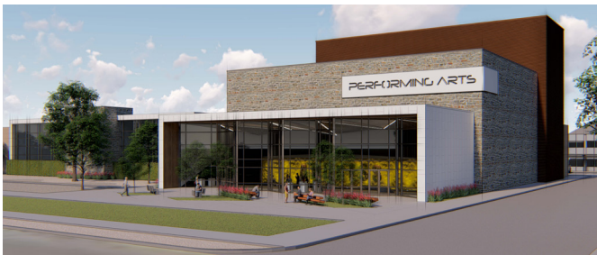
Photos: Header- El Paso High Fine Arts Center rendering Bottom- Andress High Performing Arts Center rendering

To view what stage of design/construction a 2016 Bond project is in, visit the Bond Website-Construction Projects page. Click Here.