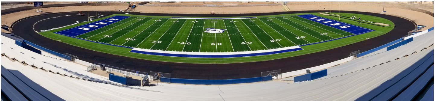
Bowie High School