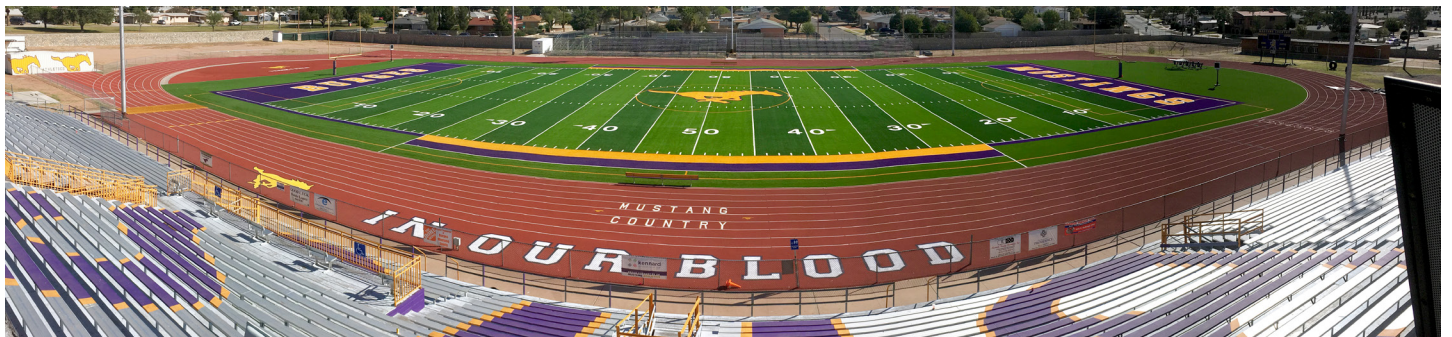
Burges High School