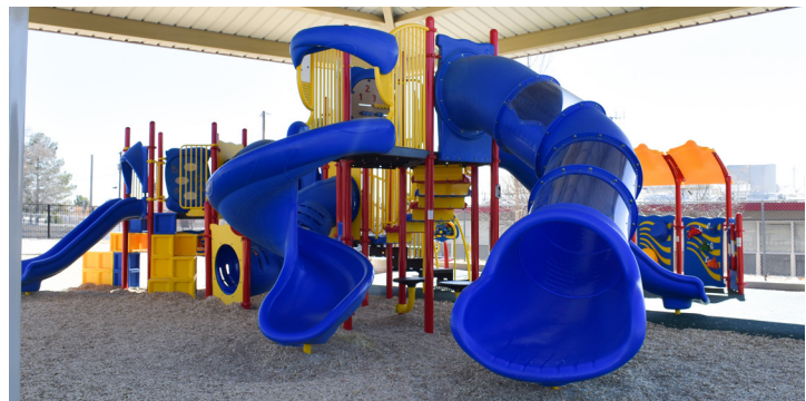
Photos: Top Left- Moreno Elementary, Top Right- Cooley Elementary, Bottom Left- Western Hills Elementary, Bottom Right: Hillside Elementary